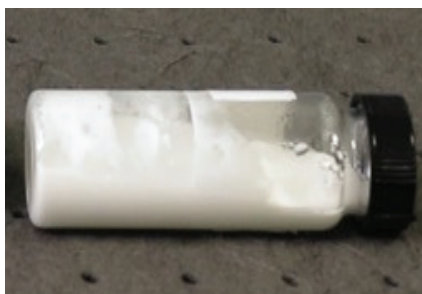
200 SC Standard

No separation or precipitation in the formulation.