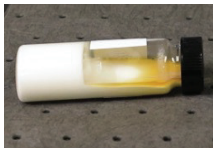
600 SC Standard

Some separation and precipitation observed.