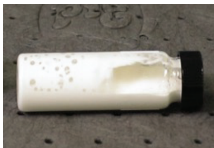
Contrado® 200 SC

Quali-Pro is committed to providing the highest quality products, from innovative active ingredients to superior formulation types. No product advances in development unless the formulation meets or exceeds the quality and performance of the competitive benchmark. Contrado SC is no exception! With many chlorantraniliprole options on the market, what sets them apart?